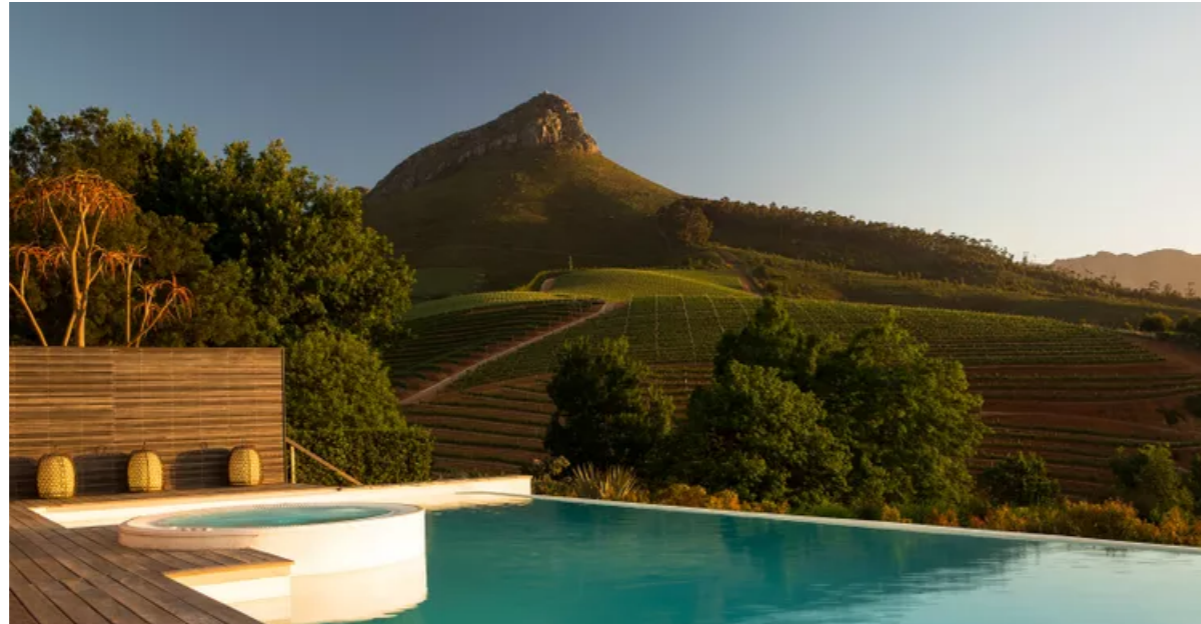
An infinity pool and jacuzzi in the Cape Winelands.

Expert Tip: Don't miss Kloof Street House for a vibrant dinner scene.