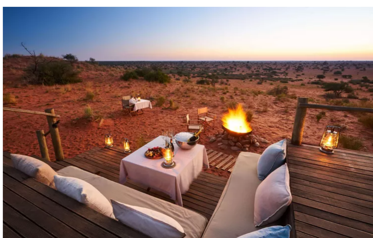
The Malori Sleepout deck on Tswalu.

Expert Tip: Prebook a private vehicle for maximum flexibility.