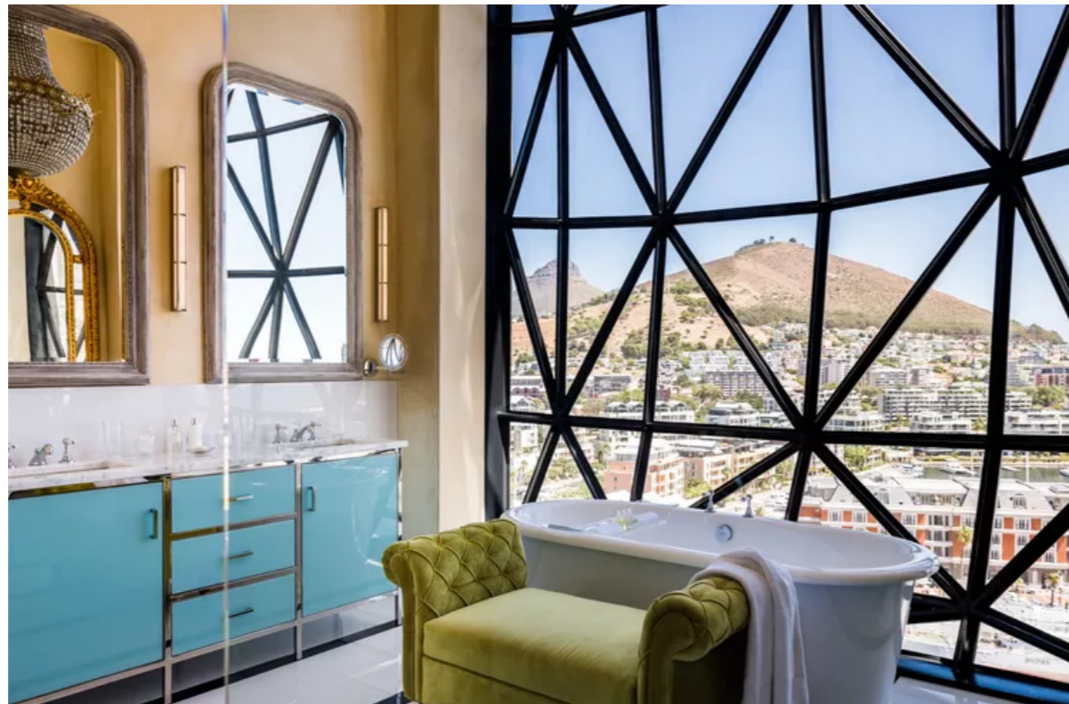
A bathroom at the Silo Hotel in Cape Town.

As a travel advisor who specializes in high-end trips in faraway places, I am frequently asked about the perfect, 12-day trip to South Africa – one filled with top-notch safaris, the best wine and food, and unforgettable experiences. While every trip we plan is tailored to individual tastes, here is one itinerary I created for the ultimate in luxury and service.