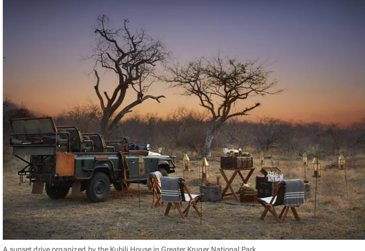
A sunset drive organized by the Kubili House in Greater Kruger National Park.

As a travel advisor who specializes in high-end trips in faraway places, I am frequently asked about the perfect, 12-day trip to South Africa – one filled with top-notch safaris, the best wine and food, and unforgettable experiences. While every trip we plan is tailored to individual tastes, here is one itinerary I created for the ultimate in luxury and service.