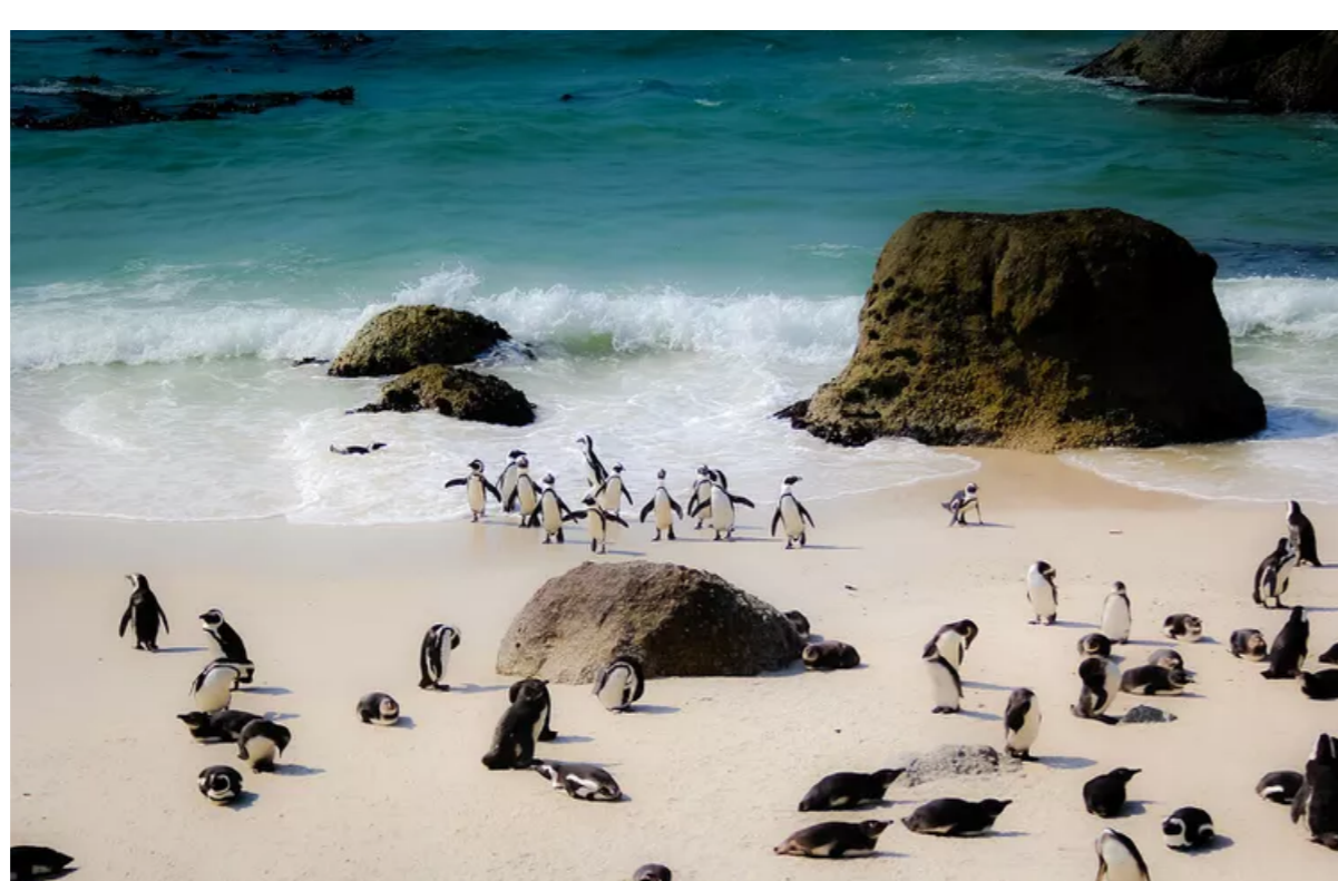
African penguins in Boulders Beach in Cape Town.

Expert Tip: Treat yourself with a trip to the oldest and most beautiful desert in the world, Namibia , and give the gift of solar lights to communities without electricity.